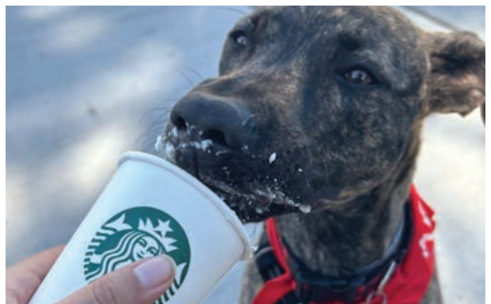
The Foster Friends volunteer experience is rewarding for both animal and foster parent alike.

Thanks to your support, we continue to expand ways to help the pets in our care, including fostering, Doggy Day Out and our new Slumber Paw-ties with shelter dogs. As a leader in animal welfare, we thank you for giving us the resources we need to always expand to meet our pets' needs. 🐾