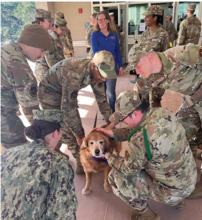
Pets lend their kindness — and a listening ear — to service members learning new languages.

Thanks to your compassionate support, we are always here for pets, wildlife ... and people!