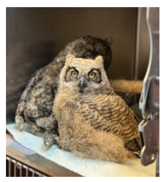
Two little owlets were abandoned and critically ill. But you made sure they weren't alone as they recovered.

Earlier this year, two young Great Horned Owls fell from their nest. We attempted to reunite them with their wild parents, but the adult owls did not return. So, we brought them into our care.