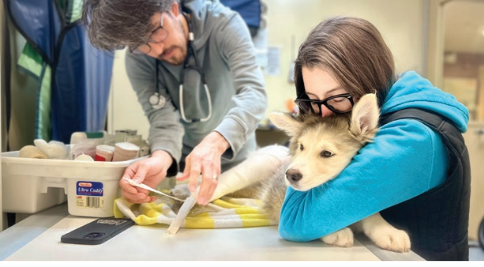
And they called it puppy love ... we can tell you have a big heart for pets like Valentine!