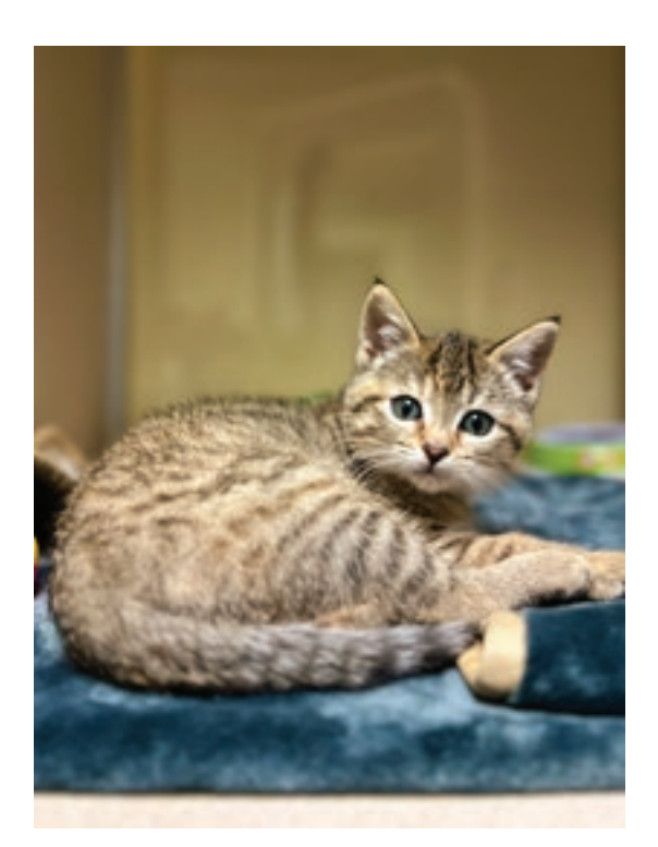
Our foster parents are heroes! They open their hearts and homes to animals like Curie who need a little extra help.

Your support of our foster program truly changes lives. Please consider joining our foster team to help pets just like Lilith Curie. 😤