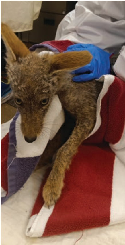
The coyote was in so much pain ... until you helped.