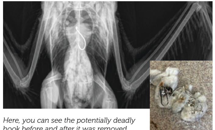
Here, you can see the potentially deadly hook before and after it was removed.

Once the hook was out, we administered pain medication and antibiotics, then moved her to our specialized shorebird pool to evaluate her for release.