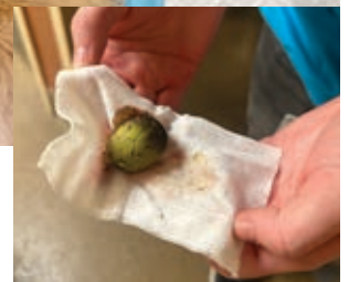
You powered the care that removed the deadly obstruction.