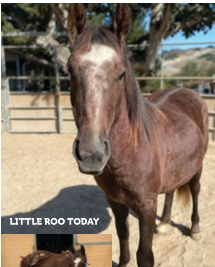
Today, you're giving her a chance to live a happy life.