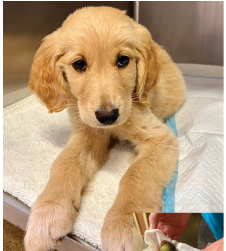
We put your gifts to work for Austin and pets like him.